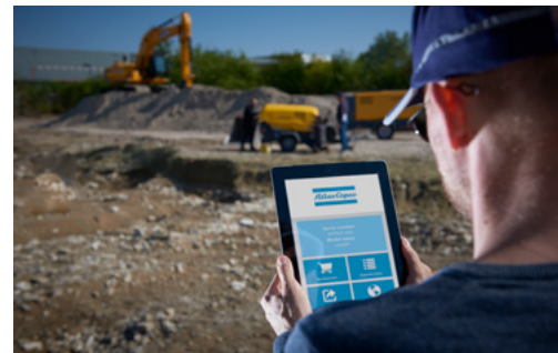
Through power connect app, quick access to view and order the relevant spare parts.