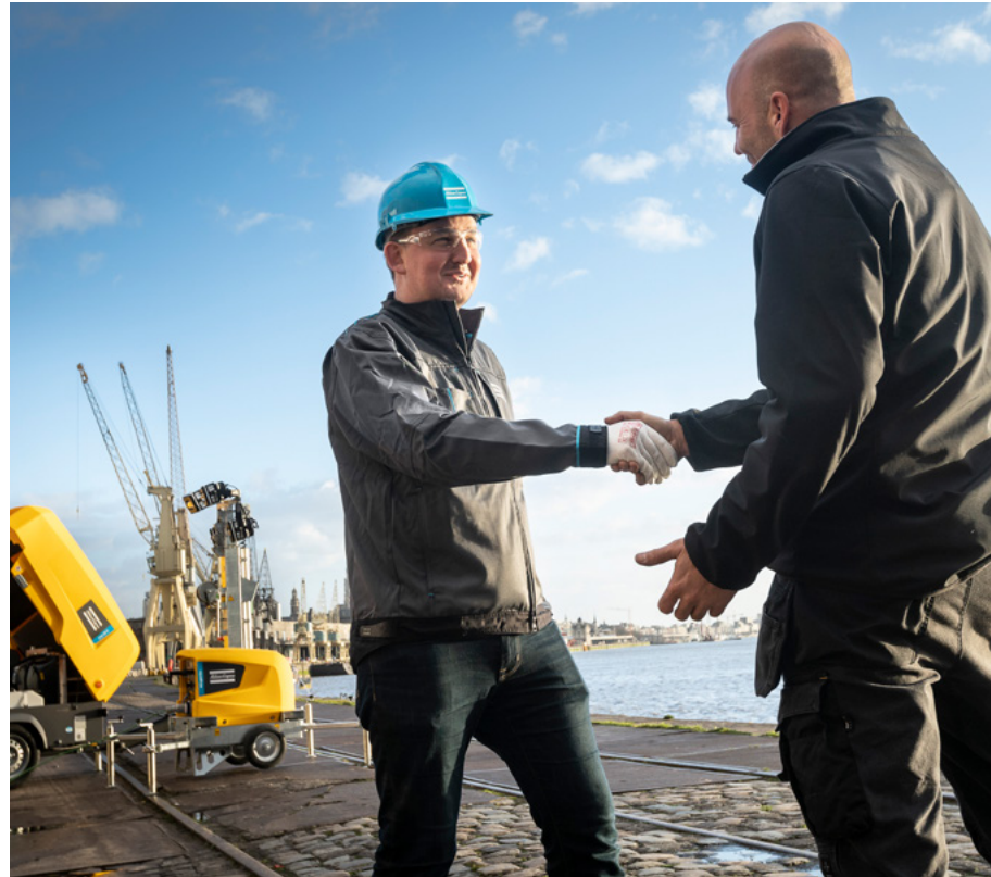
Atlas Copco ensures maximum uptime of your equipment. With the cold weather option, the compressor service interval of the XAS 188 increases from 1000 hours to 1500 hours or 2 years.

Service is a crucial part of the lifetime of a compressor. With service, you can guarantee the uptime of your compressor, while protecting your investment. On the other hand, service should take as little time as possible, so you maximize your uptime.